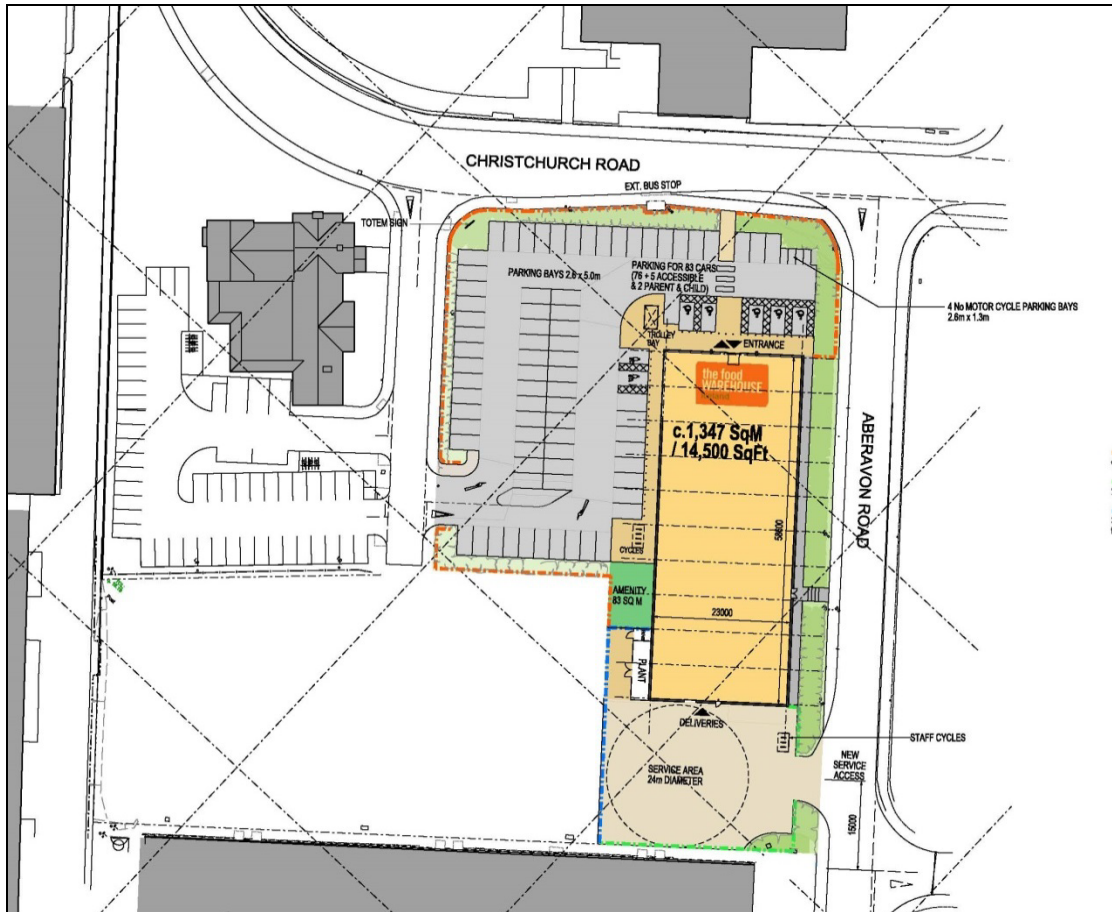
Figure 1: Proposed Site Layout